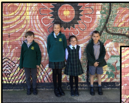
Primary looking beautiful in their uniforms.