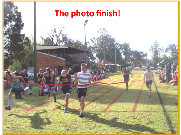
The photo finish!