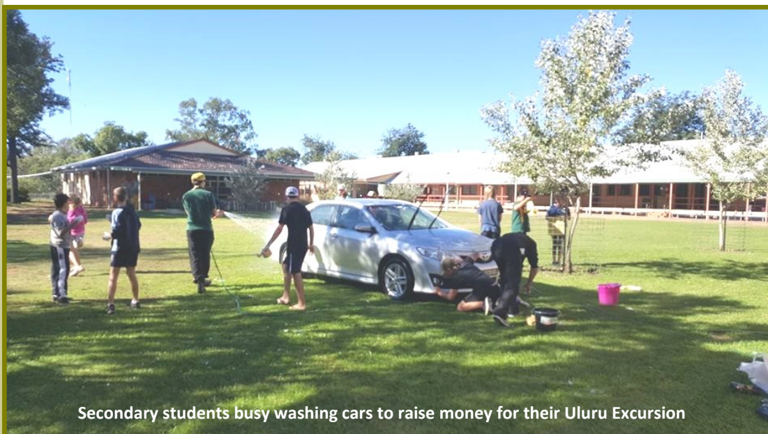
Secondary students busy washing cars to raise money for their Uluru Excursion