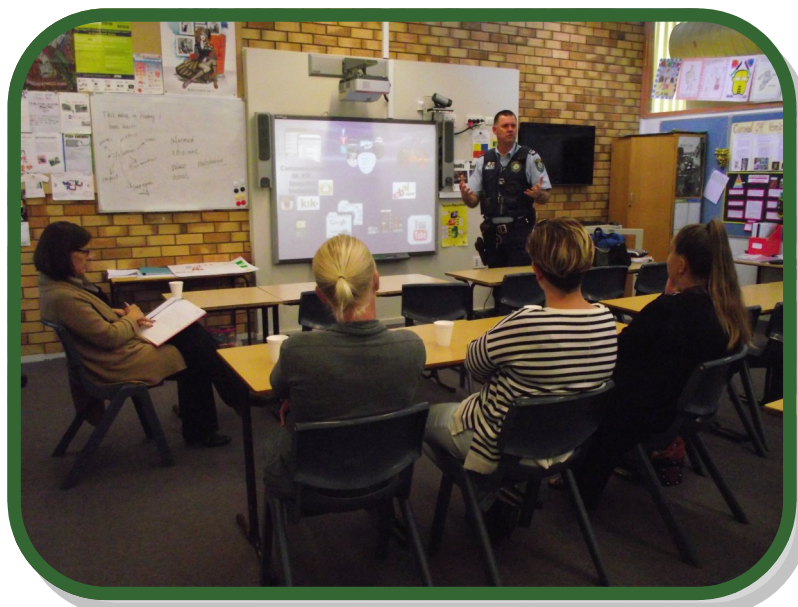
Anti-Bullying session with some interested parents