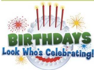
Ebony Mitchell - 27th