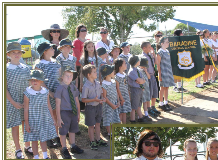
School students attending the town Anzac Day March