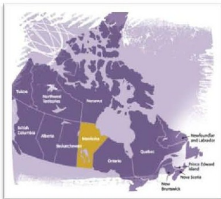
In the centre of Canada, Manitoba is called the Keystone province and Gateway to the West